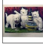
Currier & Ives "The Three Jolly Kittens at the Feast color lithograph, 17-3/4 x13-3/16"