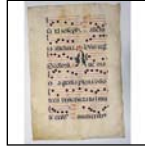
1970.7.1: anonymous Medieval Manuscript ink on parchment, 22 x 32-1/4"