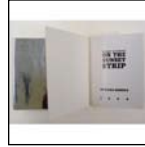
1987.28.1: Ed Ruscha "Every Building on the Sunset Strip," 1966, book, 5-3/4 x7"