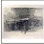
1969.1.3: Harold Altman Man etching, 9-1/2 x 8-5/8