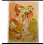
1965.7.1: Marc Chagall "Ruth and the Gleaner," lithograph, 10-3/8 x 14"