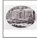
1977.3: Thomas Bewick "Selected Fables," 1968 wood engraving, 2-1/2" x 3"