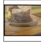
1978.9.1: Jerome Witkin "Cake," 1972 oil on board, 16 x12"