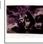
Francisco Goya from "Disasters of War," 1863 etching, 6-1/2x8-3/4"