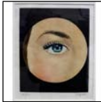
1969.8.1: Rene Magritte Lithograph