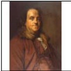
1937.1.8: Nicola Annunziata Copy of Duplessis "Benjamin Franklin", 1936, Oil on canvas, 24"x36"