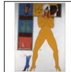
1966.1.1: Allen Jones "Pour les Levres," 1965 silkscreen 18-5/8 x 29-7/8